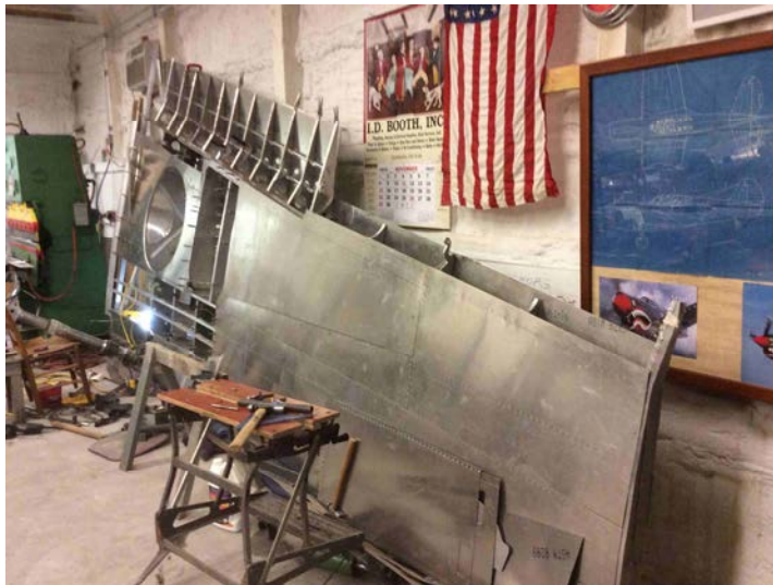
P-40: Right wing nearly complete

P-40: The 2nd wing (left side) is being assembled in the support frame. Surface skin is starting to be installed. Landing gear in the right wing is in the final assembly stage. We are making up a hydraulic system to operate the landing gear.