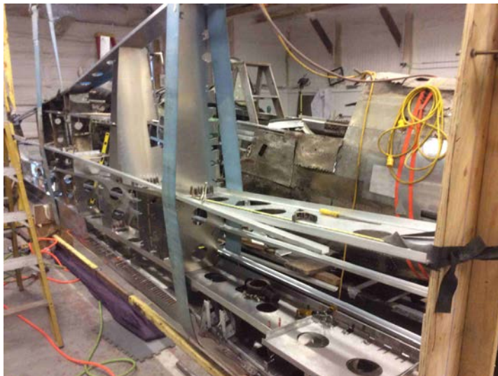
Left wing skin started

Fledgling: Assembly of fuselage seats and controls continues.