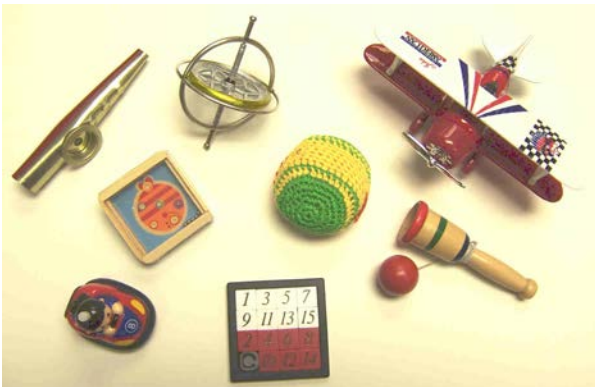
↑ Lots of cool items for the kids

A great variety of items are available for everyone on your list. We specialize in stocking-stuffers for the kids. And who doesn't need a Keuka Lake wine bottle holder.